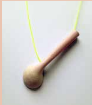
Flesh Device , 2015, pendant Copper, paint, cord