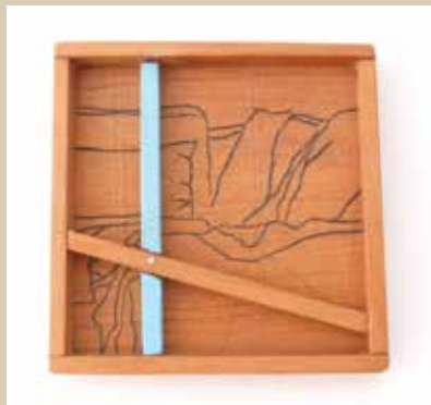
Plush , 2015, brooch Matai, paint, sterling silver, graphite, shellac

Interior, paused, plush, window, observed, waiting, moment.