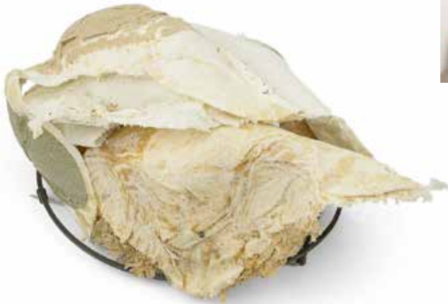
Tread softly, 2015, brooch Inner soles from discarded ballet shoes, sterling silver, brass