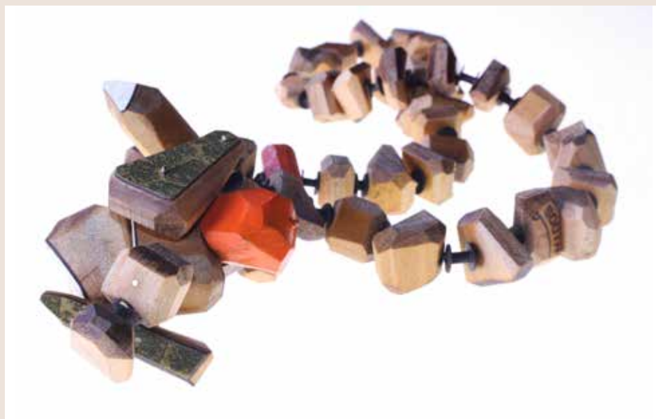
Untitled [1] , 2015, necklace Kauri, Brass, laminate, paint