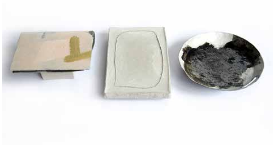
Collection of trays, 2015

Concrete, copper, aluminium, 925 silver, fine silver, thermo set paint