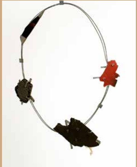
'X A H', 2015, neckpiece Oxidised sterling silver, vinyl, glass, iron powder, enamel paint