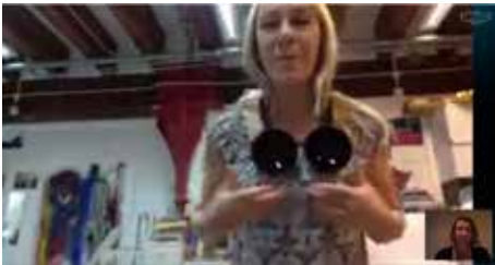
Dark Desiring (Pin Cushion) , 2015, bracelet From the series Pillow Talk