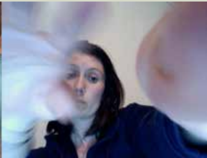
At left: Absent Presence , 2014 The Rubber Band Project , 2015 Premonition #1 , 2014