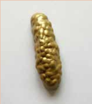
Golden poo , 2015, brooch Fine silver, autopaint

I work intuitively, hammering on metal until a form emerges. I look for that moment when the inanimate becomes animate.